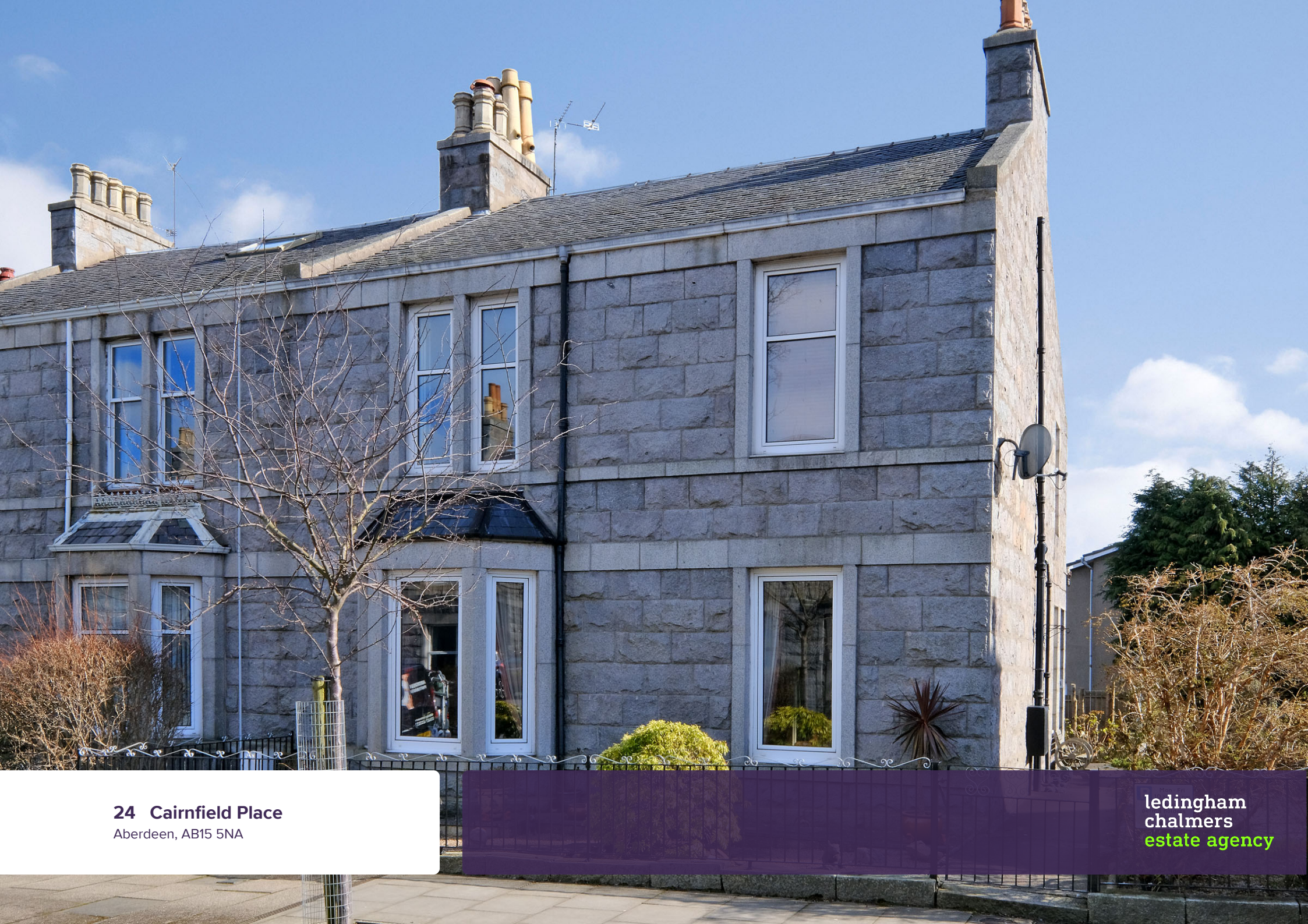
24 Cairnfield Place Aberdeen, AB15 5NA